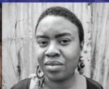
Maxine Beneba Clarke